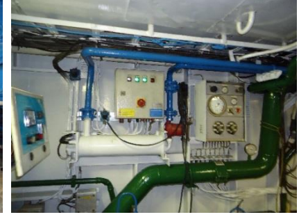
Main engine room