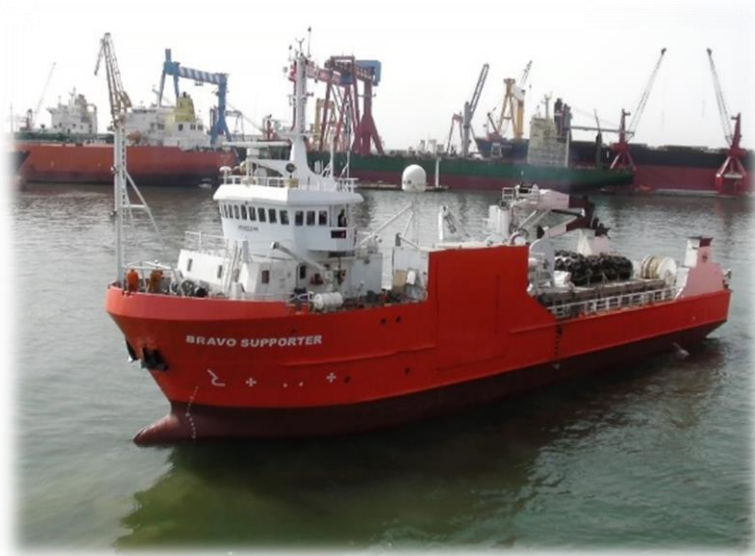
Aft deck view with winches, davit, cargocrane