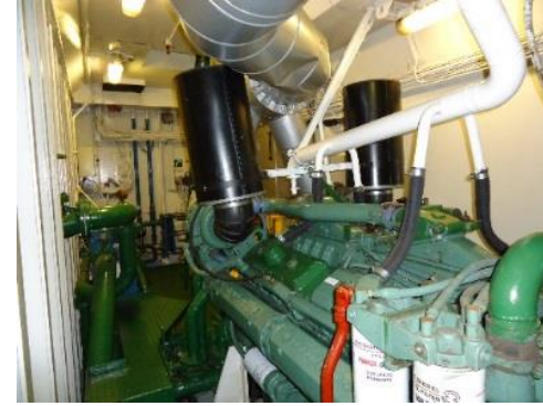
Detroit engine room (Schottel water jet engine) cooling systems for schottel and aircon systems.