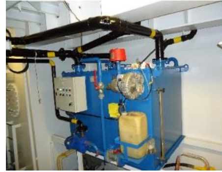
Schotter water jet room with sewage treatment plant, fresh water tanks