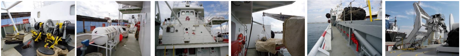
Various deck equipment, tow hook, crane, work boat davit, varous winches, rescue boat, life rafts