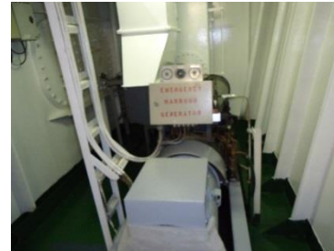
Steering gear room, deutz emergency generator