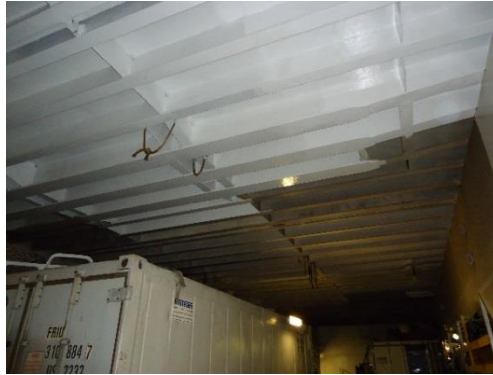
Cargo hold with reefer containers, storage and general containers and equipment