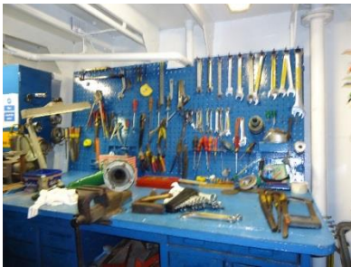
Engine room workshop