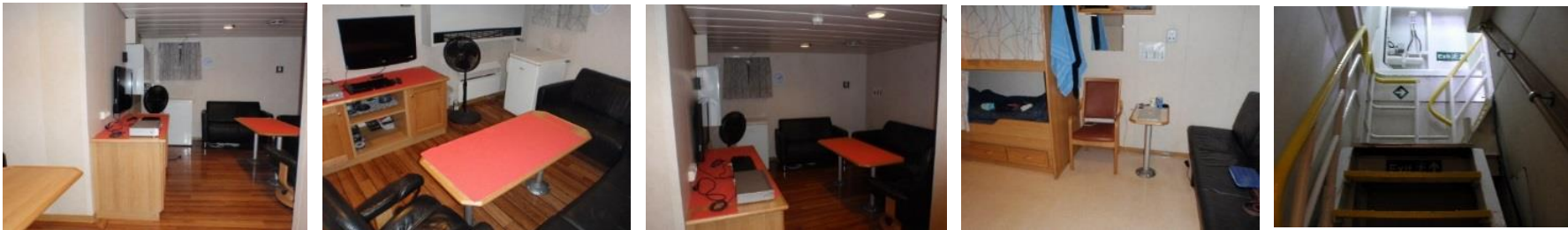
Passenger accomodation deck, Recreation room for passengers, passenger cabins, sofabed, pullman bed with total of 12 bunks