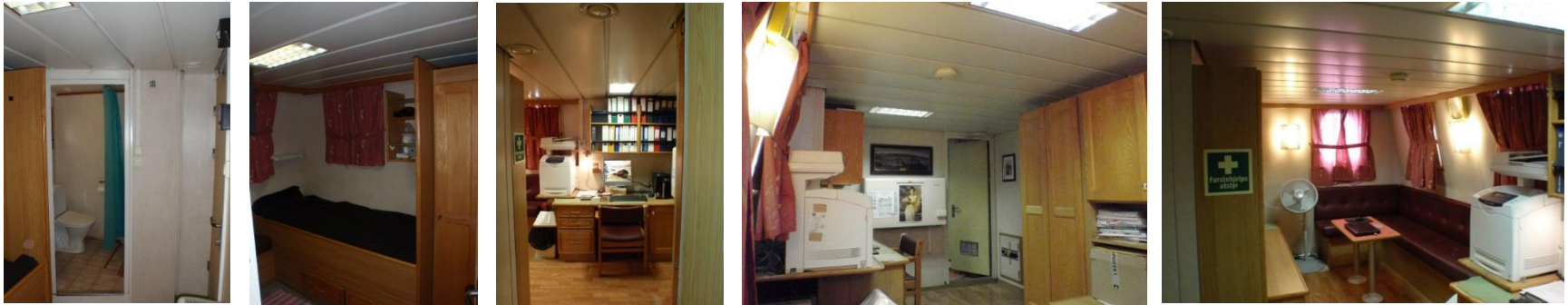
Captain cabin and office, Chief engineer cabin, officer shower room/ toilet.