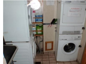
Dry provision store and laundry room