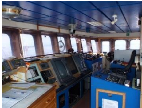
Wheelhouse, Fwd consoles, chart table, manoeuvring positions