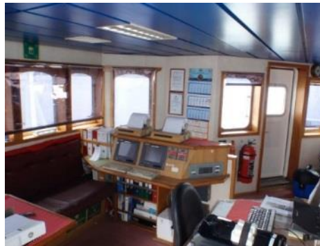
Wheelhouse, aft consol, radio station, work desk